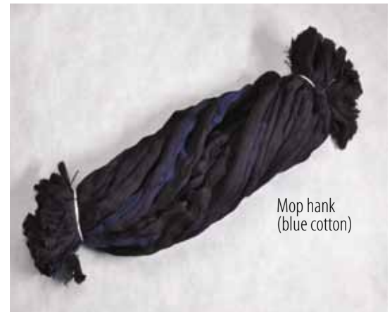
Mop hank (blue cotton)