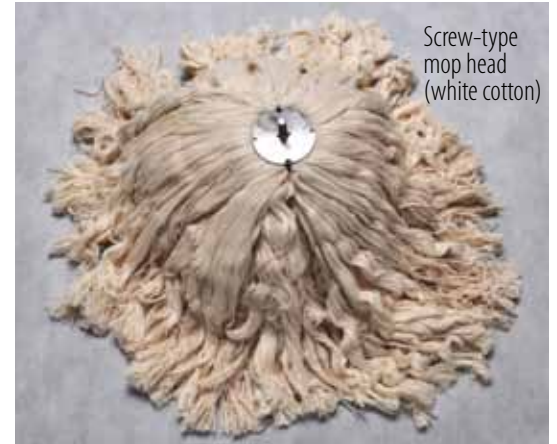
Screw-type mop head (white cotton)