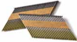
33° & 28° Clipped Head Paper Collation

Nail Sizes: 0.113" - 0.131" Lengths : 2" - 4" Finishes: Vinyl coated, hot dipped, electrogalvanized, mechanical galvanized, stainless steel Shanks: Smooth, ring, screw