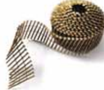
15° Wire Coil Nails

Nail Sizes: 0.113" - 0.131" Lengths : 2" - 4" Finishes: Vinyl coated, hot dipped, electrogalvanized, mechanical galvanized, stainless steel Shanks: Smooth, ring, screw