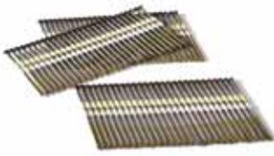
21° & 22° Round Head Plastic Collation

Nail Sizes: 0.113" - 0.131" Lengths : 2" - 4" Finishes: Vinyl coated, hot dipped, electrogalvanized, mechanical galvanized, stainless steel Shanks: Smooth, ring, screw