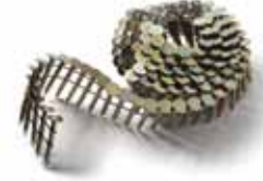
Coil Roofing Nails

Nail Sizes: 0.083" - 0.131" Lengths : 1" - 3 3/4" Finishes: Vinyl coated, hot dipped, electrogalvanized, mechanical galvanized, stainless steel Shanks: Smooth, ring, screw