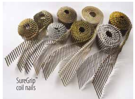
SureGrip™ coil nails